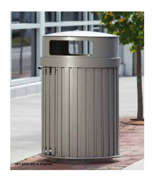
DuMor Model 287