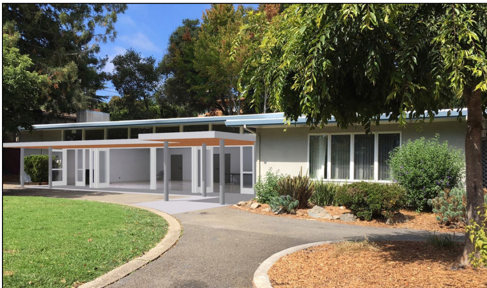
A rendering of how the facade and entry of the Community Center will look following the renovation slated to begin later this year.