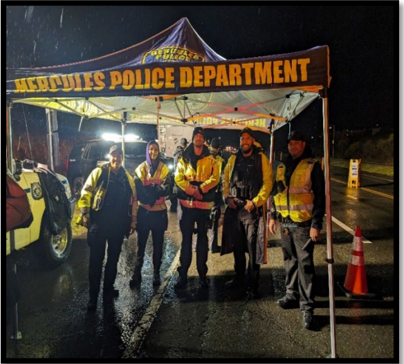
Traffic Safety Grant Patrol Operations

On Friday, December 15th, Kensington Officers were out and about looking for impaired drivers as they took part in grant-funded saturation patrols. Inclement weather kept motorists inside, resulting in lower vehicle traffic than usual. Fortunately, there were no traffic collisions reported. Nine traffic stops were completed, six citations were issued, and three warnings were given.