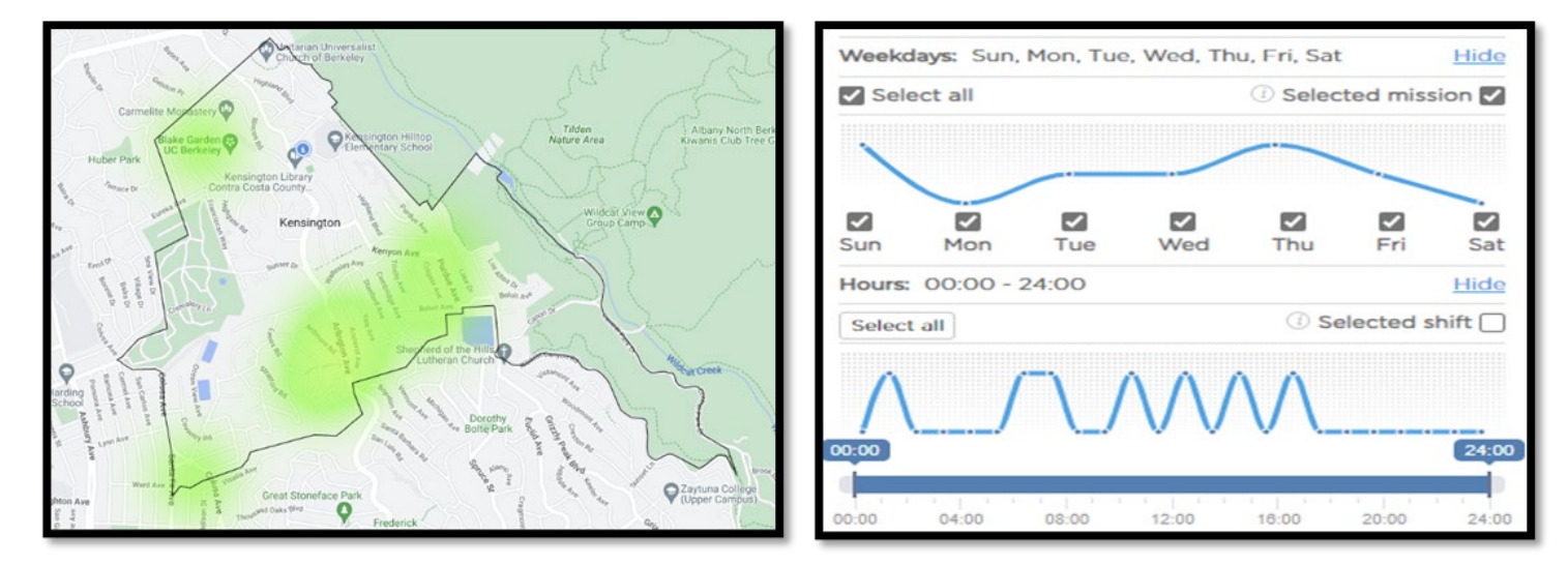
Figure 1. Property theft heat map for September 2023.